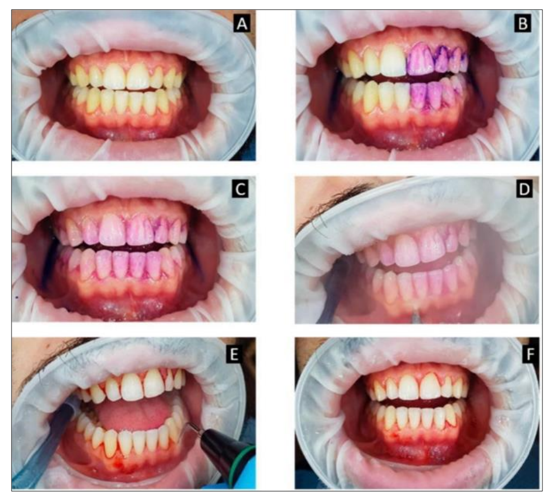
Fig 2: (A-F): Guided biofilm treatment (GBT) procedure in a patient with generalized bleeding on probing with plaque accumulation and localized calculus. (A) Pre-operative view; (B) application of disclosing agent on left half of the patient's mouth; (C) application of disclosing agent over the patient's entire mouth; (D) removal of supragingival biofilm and stains with air-polishing device (AIRFLOW® Handy); (E) removal of the calculus removal from natural teeth with PIEZON® PS allows thorough cleaning; (F) immediate post-operative view of the patient's mouth after implementing the GBT protocol (Adopted from Srivastava et al. <sup>[36]</sup>)